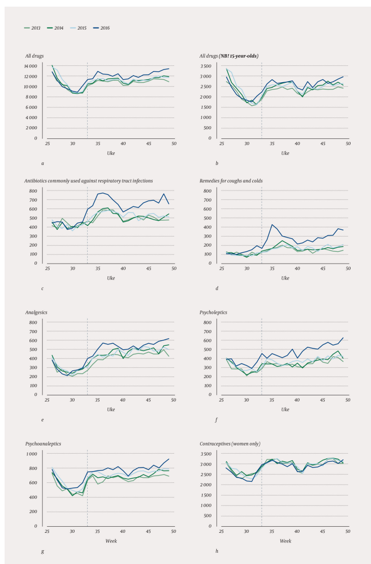
Figure 3 Dispensing rate for prescription drugs per week in the years 2013–16 (age group 16–18 years unless otherwise specified). a) All drugs. b) All drugs in the age group 15 years. c) Antibiotics commonly used against respiratory tract infections. d) Remedies for coughs and colds. e) Analgesics. f) Psycholeptics. g) Psychoanaleptics. h) Contraceptives. The dotted line marks week 33, normally the week when the school year starts (mid-August).

The dispensing rate for drugs in the analgesics group (ATC code No2) was also higher in the autumn of 2016 when compared to previous years (Table 3, Figure 3e), and this also applied to psycholeptics (ATC code No5) (Table 3, Figure 3f). As regards the psychoanaleptics group (ATC code No6), an increase may seem to have occurred each year through the period 2013–16, without any marked difference at the start of the 2016 school year (Table 3, Figure 3g). The dispensing of contraceptives to girls remained at a stable level (Table 3, Figure 3h).