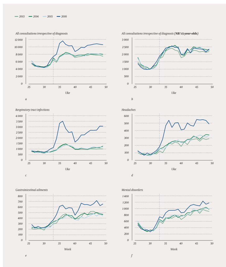
Figure 1 Number of consultations in general practice per week in the years 2013–16 (age group 16–18 years unless otherwise specified). a) All consultations. b) All consultations in the age group 15 years. c) Respiratory tract infections. d) Headaches. e) Gastrointestinal ailments. f) Mental disorders. The dotted line marks week 33, generally the week when the school year starts (mid-August).

1 Number of persons in the population basis