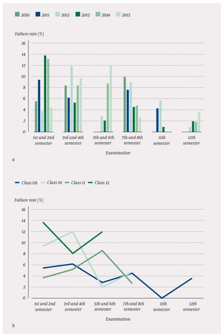
Figure 1 a) Proportion of medical students who have failed the annual examinations at the Norwegian University of Science and Technology (NTNU) 2010–15 with the current standard-setting method of 65 % correct answers needed for a pass grade. b) Failure rate (%) of four classes monitored over time; class 09 started in 2009, class 10 in 2010 etc. The x axis shows the examinations from which the data have been retrieved, while the y axis shows the failure rate in per cent.

The current 65 % method resulted in variations of up to 12 % in the failure rate for the same examination in the course of study during the period investigated (Figure 1, Table 2). For example, in the examination in the 5th–6th semester in 2010–11, there were no failures, whereas in 2015, altogether 11 students (12 %) failed (Figure 1a). The failure rate declined during the course of study (Figure 1b) and remained the same for all standard-setting methods.