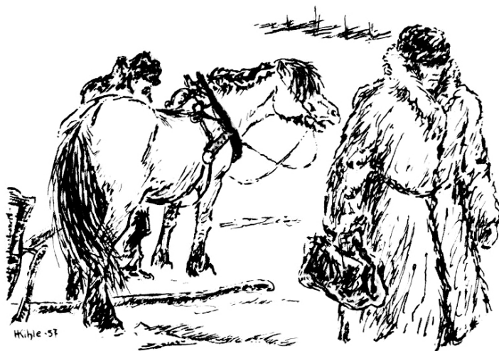
Figure 1 Vesleblakken and the doctor. Illustration by Harald Kihle (1905–97) from 1957. Figure from Thorbjørn Egner's textbook (4, page 155). Illustration © Harald Kihle/BONO

The story unfolds in the old vicarage at Øvre Rendal, Bull's childhood home. It ends with Ola and Vesleblakken travelling the thirty miles from Rendalen to Tynset, fetching the doctor in record time. On this cold winter's day, Ola drives the horse so mercilessly that it collapses and dies – but the boy is saved. Vesleblakken's heroic death has been described as one of the most tear-jerking stories in Norwegian children's literature (6), and the doctor is presented in the role of saviour: