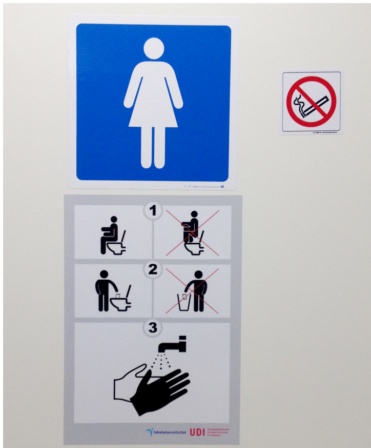
Figure 1 Information on toilet hygiene at the asylum reception centre in Sør-Varanger municipality

basement were used as isolation wards, for example in cases of vomiting or diarrhoea. The increasing flow of asylum seekers and scarcity of reception centres in other municipalities quickly exhausted the capacity of the 'Fjellhallen', and a number of hotels in Sør-Varanger were utilised.