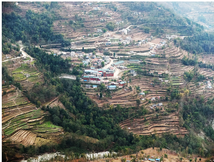
Figure 1 Okhaldhunga Community Hospital is situated on the side of the valley with terrace cultivation all around. Settlements here are scattered, but the hospital serves a population of more than 250 000 people.

Okhaldhunga District, this alone represents a number of deaths annually. Obstructed labour due to mechanical anomalies or an undiagnosed abnormal fetal position is also common. For those who fail to reach the hospital in time, this may lead to ischaemic injury with lifelong sequelae in the child or fetal death, possibly also uterine rupture and risk to the mother's life. This brings us to the heart of the matter: In a part of the world where maternal mortality is high and transport is slow and costly, how can we ensure that women in labour reach the hospital in time?