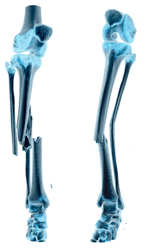
Figure 1 CT images with three-dimensional presentation of left (shown to the right) and right tibia (shown to the left) revealed dislocated fractures on both sides, most pronounced on the right side, where the fracture was open.

The patient was given pain relief in the form of small doses of fentanyl and ketalar in Acute Admissions. A CT scan revealed a fractured left femur shaft and bilateral lower leg fractures (Fig. 1). CT head, spinal column, abdomen and pelvis were normal. CT thorax revealed small contusion changes anterobasally in the left lung.