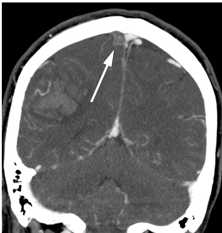
Figure 2 CT venography showing a filling defect in the right superior sagittal sinus, consistent with a partial occlusive thrombus