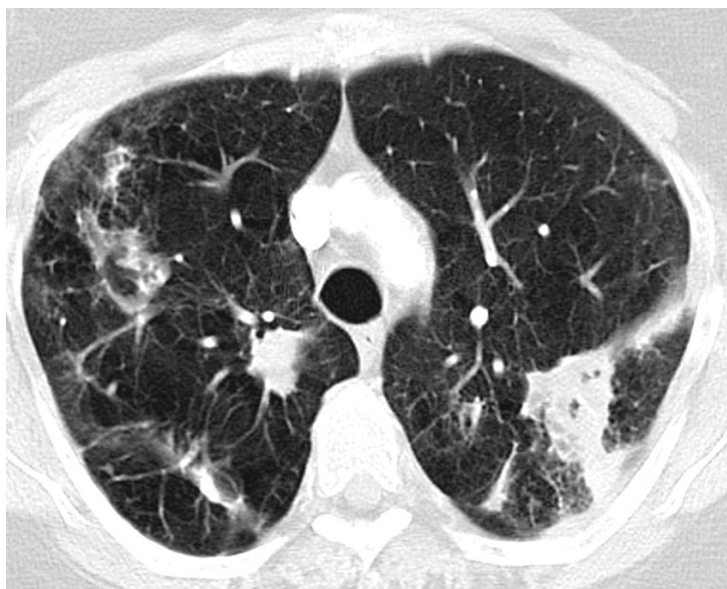
Figure 1 CT thorax of a patient with severe COPD with emphysema. Cavernous and fibrotic changes and infiltrates are seen. There was repeated growth of M. intracellulare in bronchial specimens.