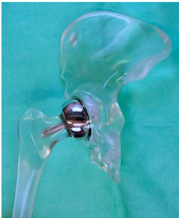
Figure 1 A Birmingham hip resurfacing prosthesis (Smith and Nephew, Warwick, England), implanted here in a hip model, has metal-on-metal joint surfaces where the 'cup' and 'head' consist of a cobalt-chromium-molybdenum alloy with 66 % Co, 26.5–30 % Cr, 4.5–7.0 % Mo, <1 % Ni, Mn and Fe, and <0.35 % C, in accordance with ISO standard 5832.

According to the Norwegian Arthroplasty Register, 485 resurfacing prostheses were implanted in patients in Norway between 1987 and 2013, of which 466 were BHR prostheses (4, 5). Several countries have experienced an increased incidence of adverse soft tissue reactions which led to complex revision surgery of metal-on-metal prostheses. Pseudotumours (6), aseptic lymphocyte-dominated vasculitis-associated lesions (ALVAL) (7) and adverse reactions to metal debris (ARMD) (8) are all terms that have been used to describe potentially harmful reactions to metal wear products released from the bearing surfaces of such prostheses. The revision rate for several types of resurfacing prostheses was high, partly due to these soft tissue reactions, and partly due to other complications such as femoral neck fractures and prosthesis dislocation (9). These complications eventually led to a rapid reduction in the use of such prostheses (2). In many countries, including Norway, the use of metal-on-metal prostheses was discontinued in 2013.