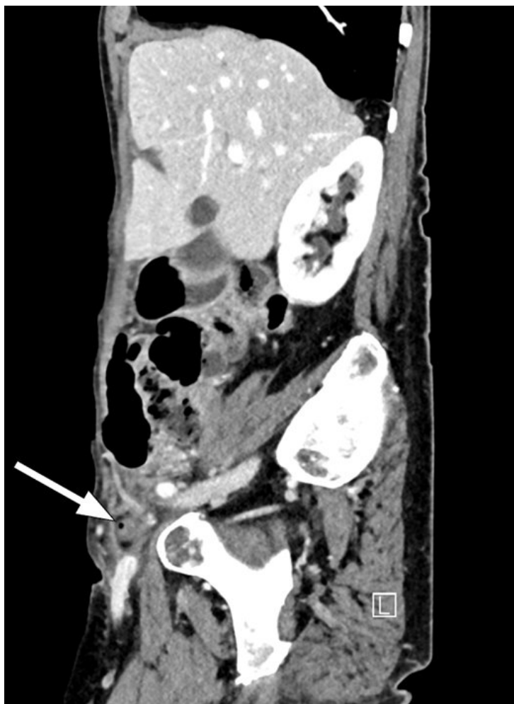
Figure 2 Sagittal CT scan. The arrow shows a mass in the inguinal canal with a small gas bubble.

The patient was hospitalised for five days, during which time her CRP levels decreased from 182 mg/L to 41 mg/L and leukocytes from 14.9 g/L to 10.3 g/L. She was discharged to a short-term placement in a nursing home because of reduced general condition, and because she required assistance with mobilisation. At this point, her antibiotics were changed to oral trimethoprim/sulfonamide 2 tablets \times 1 and metronidazole 400 mg \times 3 for two days, to give a total of seven days of antibiotic treatment.