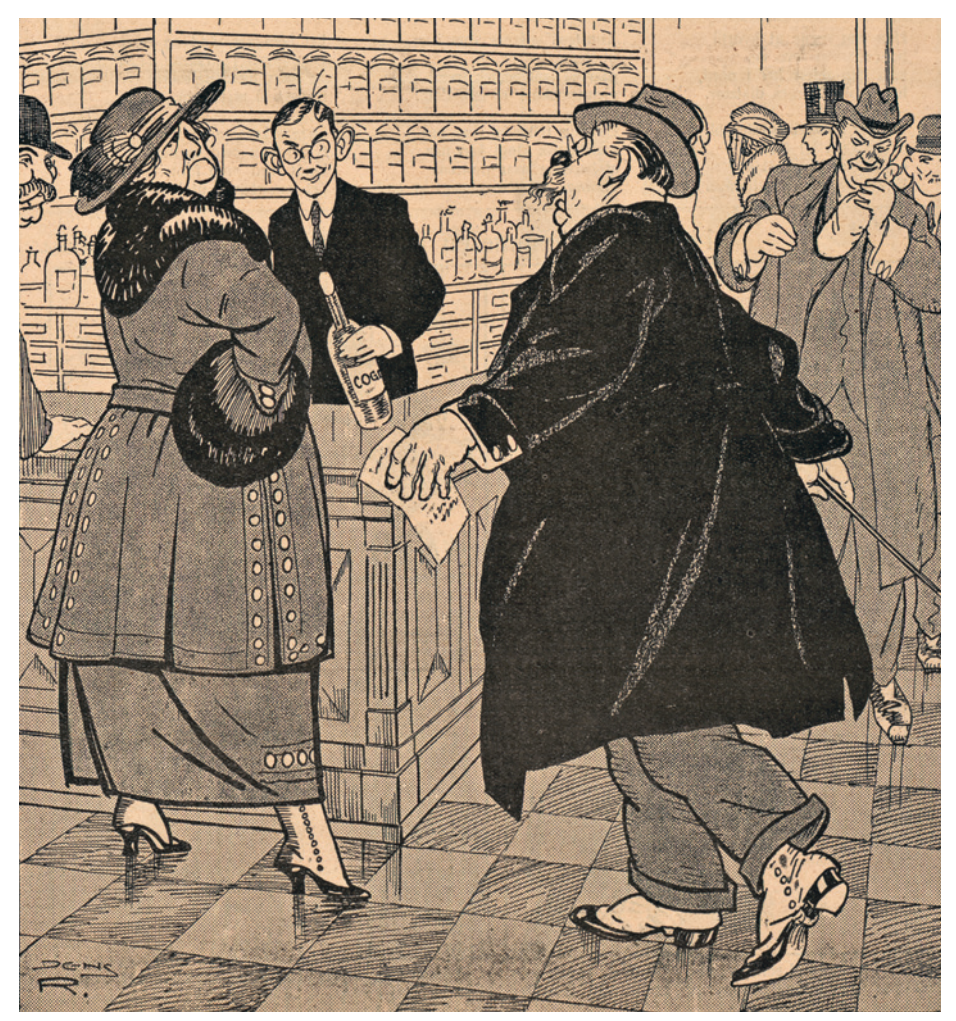
Figure 1: The boundary between alcohol as an indulgence and as a form of medication remained blurred until well into the 20th century. Here, the artist Jens R. Nilssen (1880–1964) has depicted an episode in a pharmacy in the satirical magazine Hvepsen [The Wasp], no. 9/1921. Drawing by © Jens R. Nilssen/BONO.

Our article is based on a review of articles on the alcohol issue in the Journal of the Norwegian Medical Association from the period 1916–1926. This material provides a deeper insight into the role of doctors as prescribers of alcohol and their views on alcohol as medicine. The authorities' attempts to regulate the prescription of alcohol are described in another article (6).