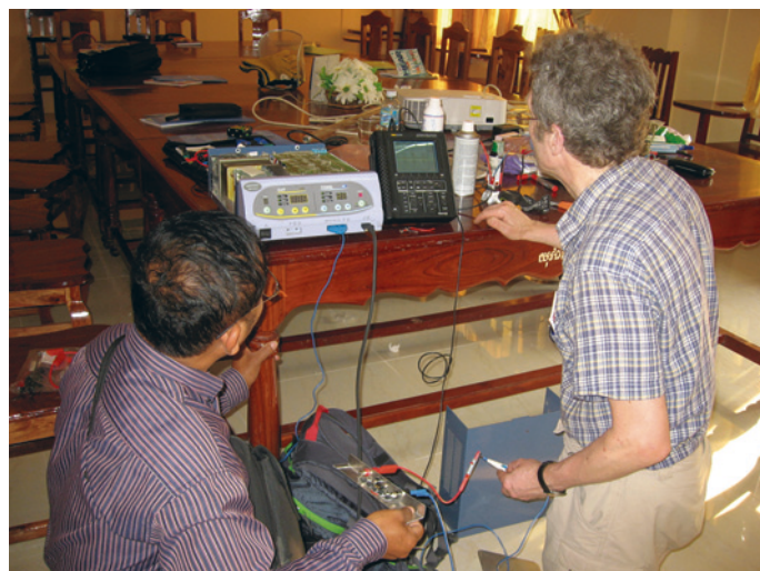
Repair work on the diathermy

electricity. The instructors demonstrated safety equipment such as gloves and visors, and each hospital was provided with a simple multimeter for use locally. A practical course examination was held, including basic first aid in accidents involving electricity, before all participants received their course certificate.