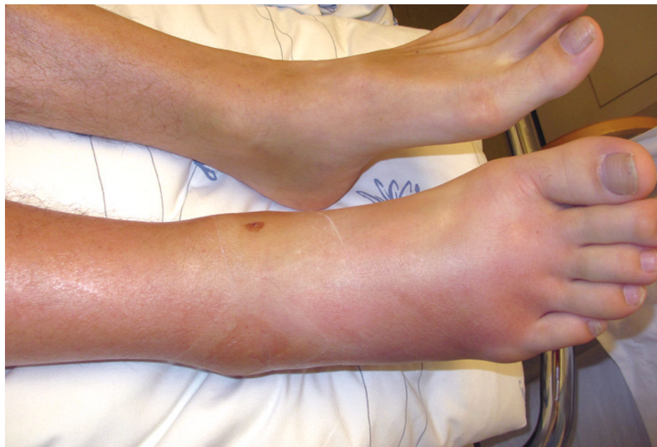
Figure 1 Right ankle upon admission.

After ten days of antibiotic treatment, the patient was still experiencing fever and pain, and CRP remained elevated at 145. We therefore chose to administer prednisolone, initially 40 mg 1 × 1 for four days, followed by gradual tapering over three weeks. Two days after initiation of prednisolone, the patient became afebrile and his CRP level decreased rapidly. Seven days later, the patient was discharged with oral azithromycin, and prednisolone in decreasing doses. His CRP level